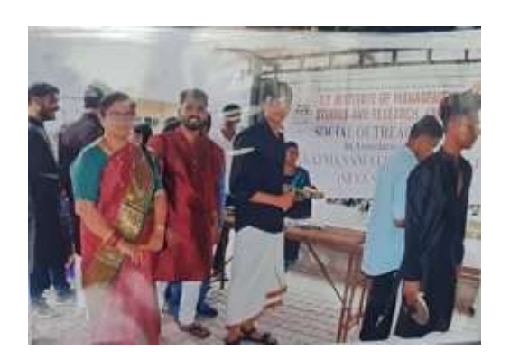
Food stalls under the social awareness campaign.